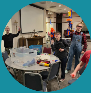
Jr High Nerf Night