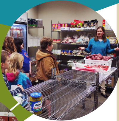
Food Pantry Tour